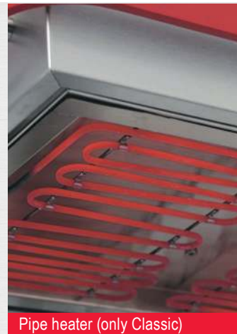
Pipe heater (only Classic)