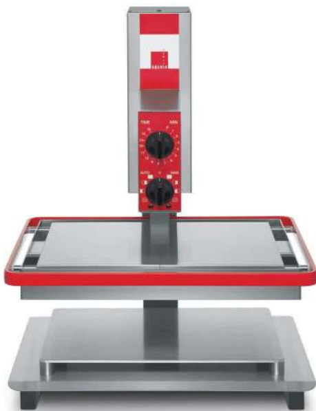
Salamander Salvis Vitesse

Ceiling and wall mounting sets are available for flexible positioning in the kitchen. The installation variant on a range is carried out by a salamander board.