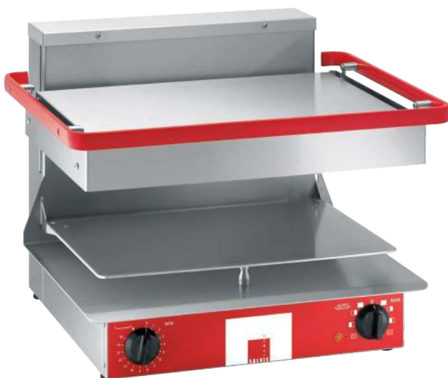
Salamander Salvis Classic

Thanks to the high-quality workmanship, large radii and the foldable plate rest, the cleaning process is quick and simple.