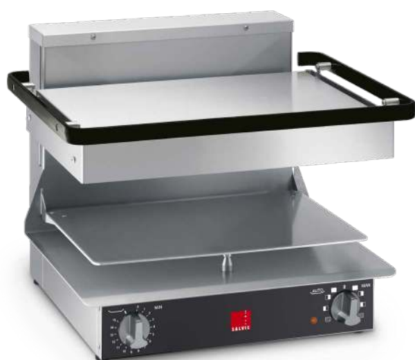
Salamander Salvis Classic - black