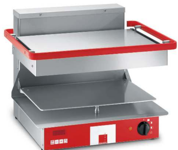
Salamander Salvis Classic Pro