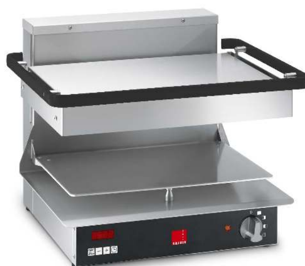
Salamander Salvis Classic Pro - black