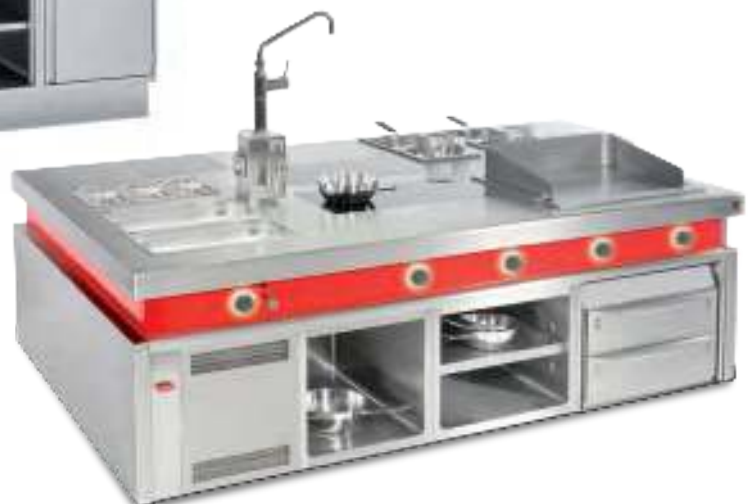
Range of hobs Salvis VisionPRO