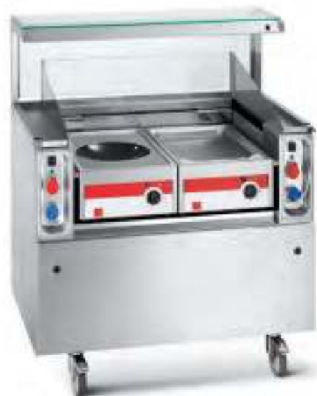
Mobile Cooking Station Salvis Fresh&Smart