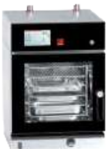
Salvis CucinaEVO 623T

A-la-carte selection Convenient for working at stations and in bistro kitchens Pro models with cooking programs and a cleaning system