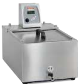
Sous-Vide Circulator Salvis SousChef

Reduces food waste and film consumption by up to 65 %