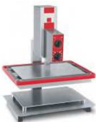
Salamander Salvis Vitesse

Fresh cuisine guaranteed! Handy practical design with efficient technology