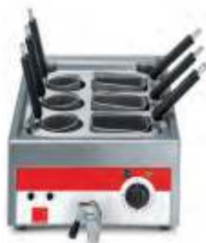
Pasta Cooker Salvis Smartline