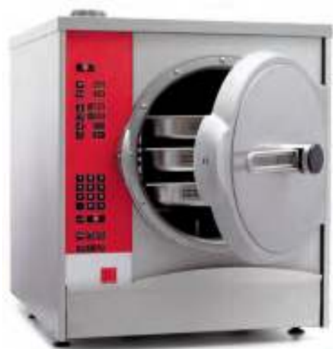
Pressure Steamer Salvis Vitality Pro

The food preserves its colour, shape, aromas and nutritional value