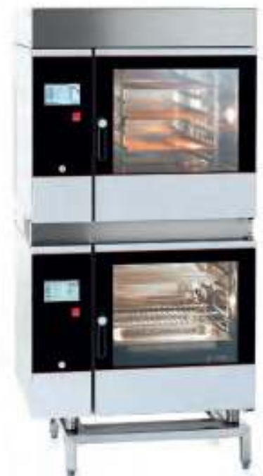
Salvis CucinaEVO Dual Rack 611QT on 611QT