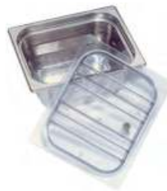
Vacuuming Packaging System Salvis GreenVAC