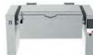
Frying Pan Salvis Crystal Pro