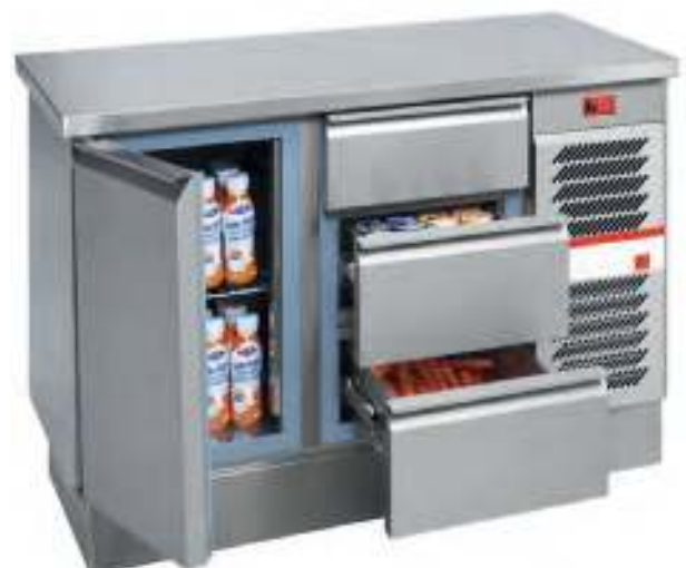
Refrigeration Furniture Salvis Gastroline