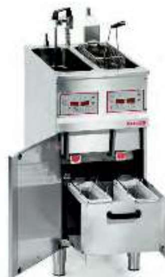
Deep Fat Fryers Salvis Fryline Pro, Type SFR42

Less oil consumption thanks to a powerful flat heating element. The electronic sensor allows for deep fat frying at temperatures as low as 165 °C