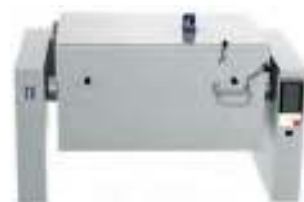
Pressure Cooker Salvis Crystal Pro