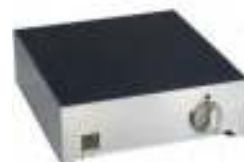
Induction / Ceran Salvis Compactline