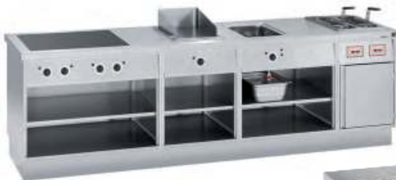
Range of hobs Salvis Master

Quality through in-house production. The thermal components are developed, tested and installed in our own factory This is the only way that we can guarantee a high standard of quality and performance