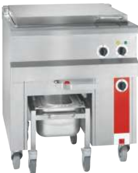
Frying and Cooking Appliance Salvis Marmite 800 Plus