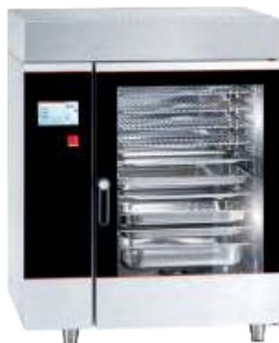
Salvis CucinaEVO 1011QT