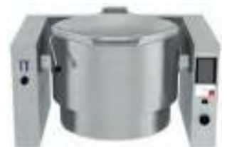
Tilting Kettle Salvis Crystal Pro