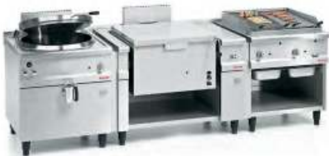
Food Service Equipment Salvis ProfiLine

Different body heights and assembly options, such as wall- or floor-mounted Motor-assisted tipping