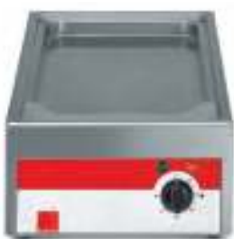
Griddle Plate Salvis Smartline

Ergonomic workstation with minimum space requirements