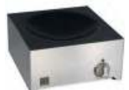
Induction Wok Salvis Compactline