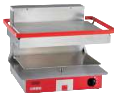
Salamander Salvis Classic